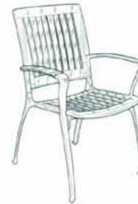
Under 50 lbs, Place out with Regular Solid Waste

How do I know when to request a Bulky Item Collection? Is your item over 50 lbs?