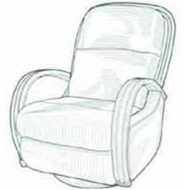
Over 50 lbs, Request a Bulky Item Collection