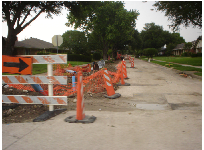
Birch Street may have a new water line by the time you read this newsletter. Ongoing problems have delayed completion of this project keeping traffic to one lane.