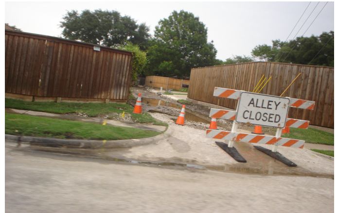
Progress is frustrating sometimes. This Tiffany alley repair was to be completed in mid June but phone lines were accidentally torn out causing more delays. City officials say it should be finished in mid July.