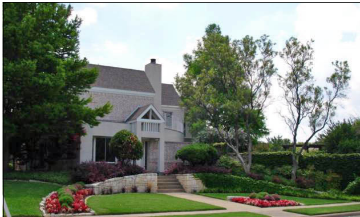
600 Park Bend Alec and Tamie Kettle